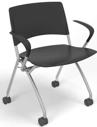
Twenty2 - nesting chair

Tools: Phillips head, Robertson screwdriver, box cutter knife, hammer or rubber mallet, flat headed screwdriver or similar wedge shaped tool.